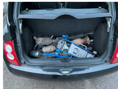
Left: Findings from the A13 stop on 30th November

We are aware of concerns in relation to dogs being stolen, however it has become apparent that conversations being had may not reflect current recorded crimes. At the beginning of February, officers stopped a van in Loughton linked to reports of suspicious behaviour across the district. After speaking with the driver and searching the van, officers were content there was no cause for concern and no criminal offence had been committed. Please keep reporting to help us respond. Essex Police has a Dog Watch scheme encouraging dog owners and walkers to be extra eyes and ears within the community. For more information and/or to join, please email: essex.watch.liason.officers@essex.police.uk .